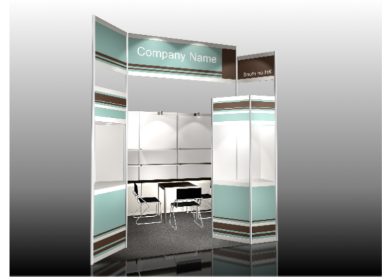
COLOUR PERSPECTIVE N.T.S